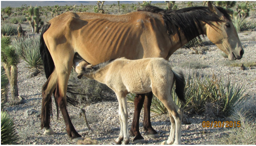
A wild horse mare and foal in very poor condition in Nevada because of lack of forage. In 2015, the BLM conducted an emergency gather of these horses.

As wild horse and burro populations rise, there are serious consequences for the animals and the land. Horses and burros starve, dehydrate and wander onto private property or highways. Land health and habitat for sage grouse and other wildlife is being compromised.