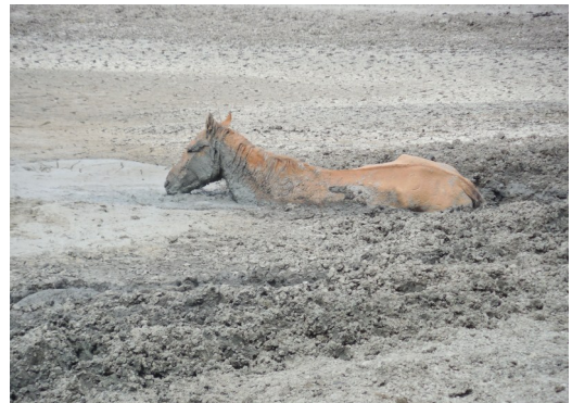
A wild horse in a drying lake bed in Oregon. The BLM conducted an emergency gather in 2014 to remove imperiled horses from this herd.